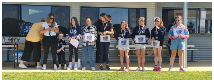
J3's presentation above