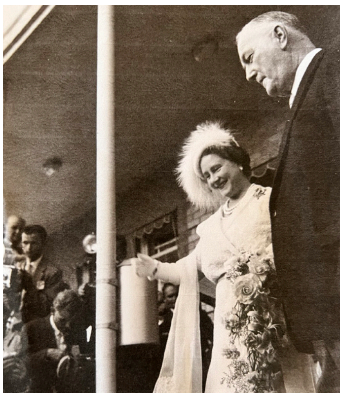
Above and below: Queen Elizabeth and the Queen Mother and Sir Lyell McEwin at the opening of the Queen Elizabeth Hospital.