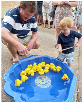
The duck catching competition was a hit with the little kids!