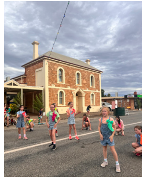
The girls from Carmen's School of Dance