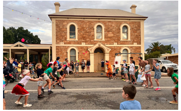
The annual water balloon throwing competition