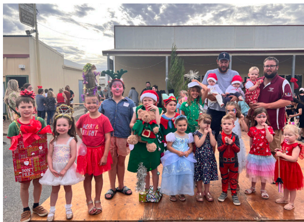
The fancy dress competitors