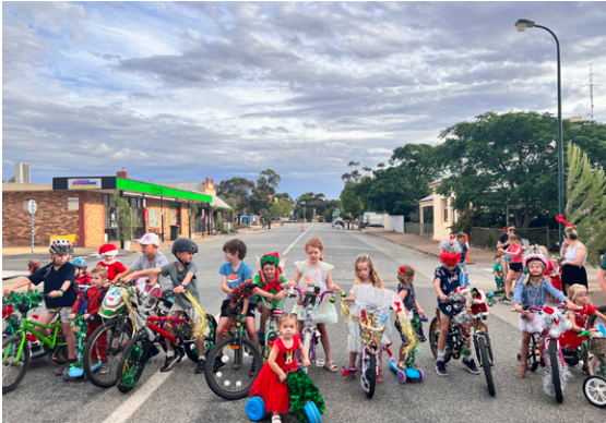
The decorated bike competition participants