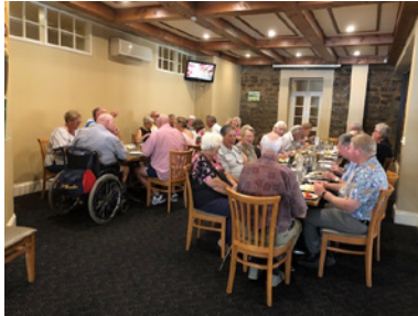
Above- Members enjoying the wind up at the middle pub (sponsor)

the trophies back at club rooms. Blyth Bowling Club will holding Winter Bowls, starting Tuesday April 20, starting time 9.30 for 10am, for a couple hours. New bowlers are welcome. Hope to see you there. Annual General Meeting will be on the Tuesday 27 April at 7.30 at the Blyth Bowling Club.