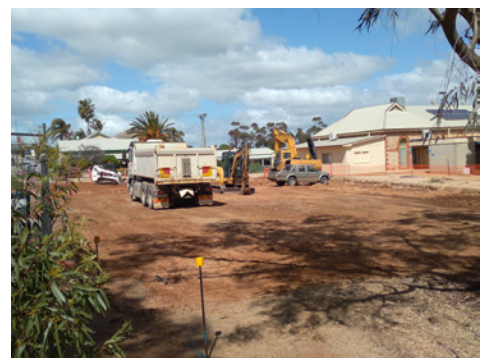
Right: The Blyth Hall/Cinema carpark is well underway for it's new bitumen surface.