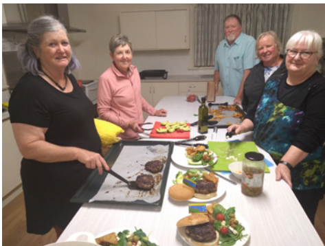
Left: The Blyth Hall Committee catering for a pre movie dinner during the Festival of the Lamb.