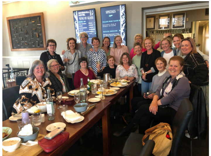
Golf girls out to lunch, Ladies wind up day.

If anyone is keen for a game of golf at Blyth in 2022, we play each Wednesday from late April-mid September & you are very welcome. We can guarantee you will end up loving golf, or if not that bit, you'll enjoy the company at the 19th hole.