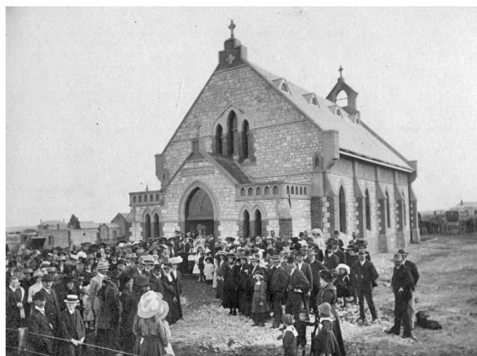
Burkanendi Homes previously was the site of St Stanislaus Catholic Church (opening 1910)

-Written in 1994. Supplied by Brian Eime.